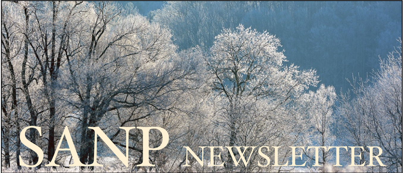
Cold Cades Cove.