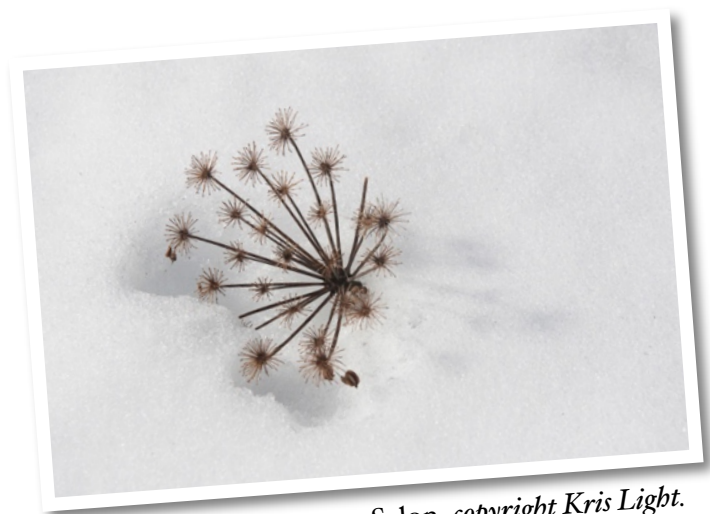
Frozen Fireworks, 2015 Salon, copyright Kris Light.

-- Lewis Carroll, Alice’s Adventures in Wonderland & Through the Looking-Glass