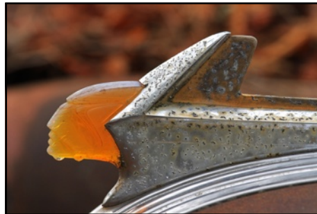
Photos from Old Car City

“I wonder if the snow loves the trees and fields, that it kisses them so gently? And then it covers them up snug, you know, with a white quilt; and perhaps it says, “Go to sleep, darlings, till the summer comes again.”