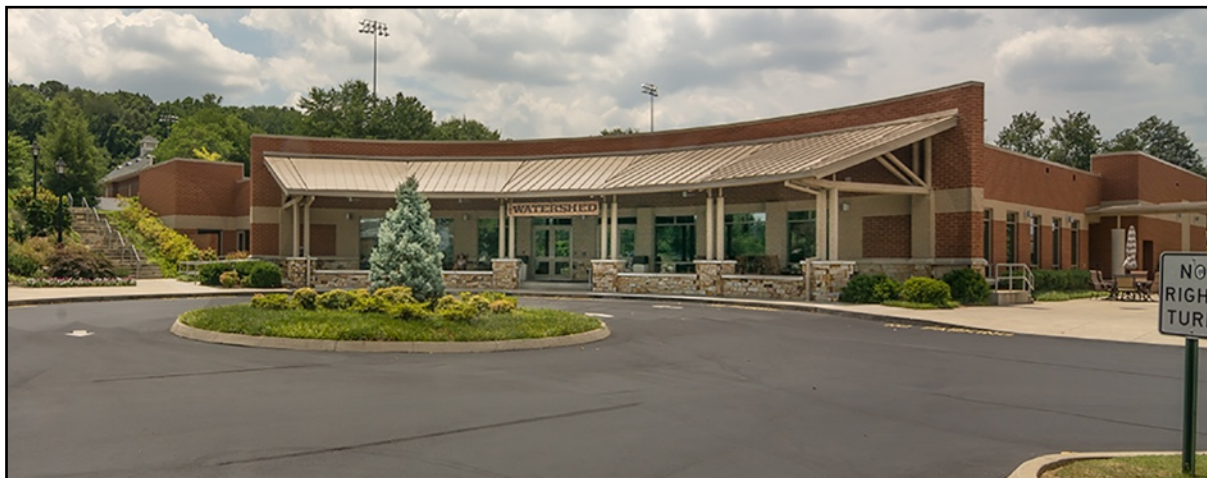
Watershed Building at Cedar Springs Presbyterian Church, Knoxville.

Once you enter the main door of the Watershed Building (shown in the photo below), walk straight back to find the Ramsey Cascades Room.