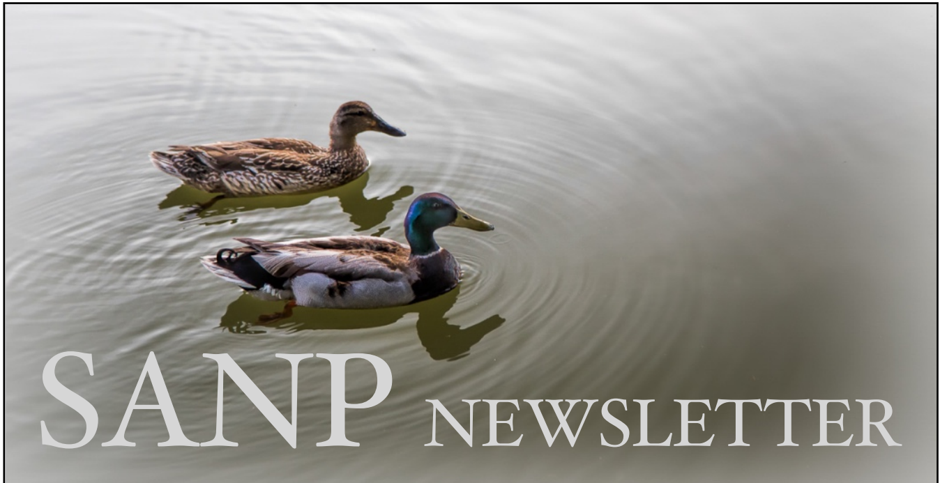
Mated Pair.