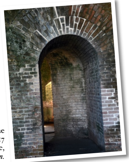
Photo at right: Light at the End of the Tunnel, 2017 Salon, Travel and Place, copyright Clay Thurston.