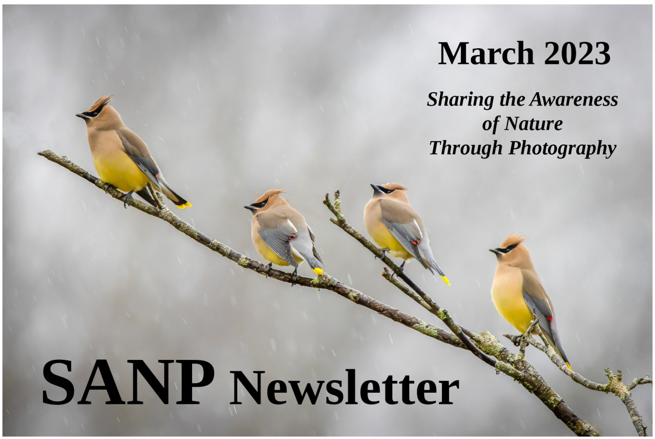
Cedar Waxwings in the Rain. Honorable mention, Birds category, 2022 Print Image Salon. © Jeff Parlow