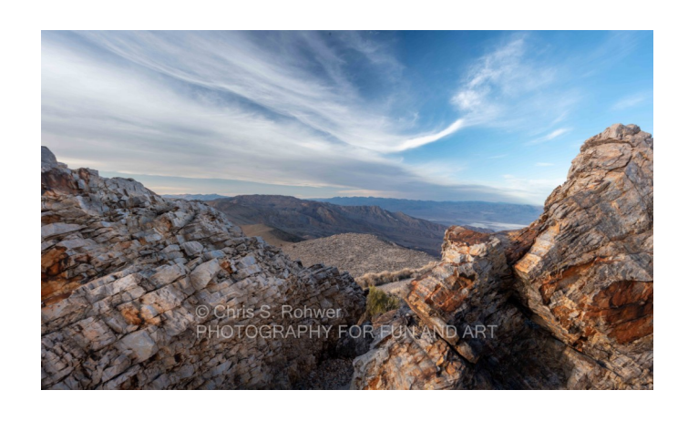
All images © Chris Rowher