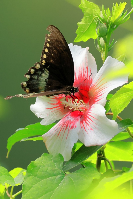
Along the Songbird Trail at Norris

Contact Ann to share your story! Please put "SANP history" in the subject line.