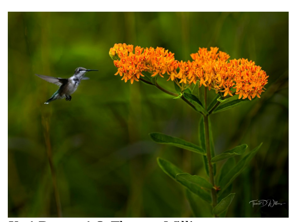
Yes! Dessert!

Welcome aboard, we look forward to getting to know you all!