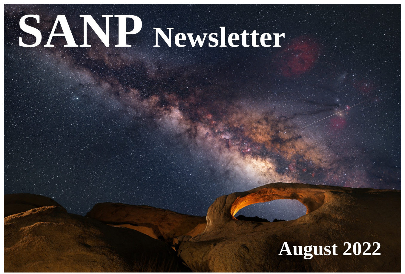
The Night Sky over Desert Arches.