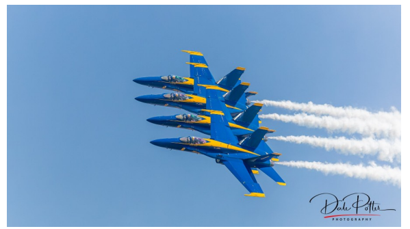
Blue Angels in Formation, ©Dale Potter