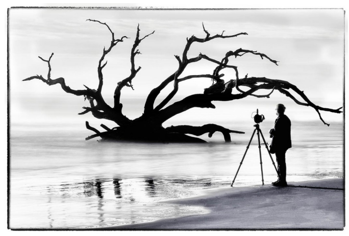
The Capture, Black and White-Other category, 2022 Digital Image Salon

SANP is a member of 3CT, a network of camera clubs across Tennessee and neighboring states. Their monthly newsletter is filled with information about meetings and events for member clubs. Details can be found on their website <u>www.3ct.org</u> or on Facebook at <u>https://www.facebook.com/CameraClubCouncil OfTennessee</u>