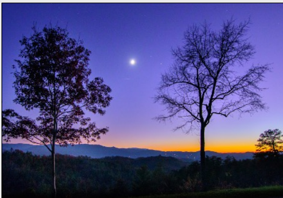
Foothills Parkway night scene.

My second image of the crescent moon was taken with my camera mounted on a StarTracker, my lens zoomed out to 600 mm, and a shutter speed of about 2 seconds. With this image exposed for the shadows, the sunlit side of the moon was greatly blown-out. This image looks like a poorly done composite, but it is only a single exposure. AND – do you see several Starship Enterprises orbiting the moon in the cropped blowup? Or are they just artifacts? Or just out-of-focus gnats orbiting my lens? Or maybe stars?