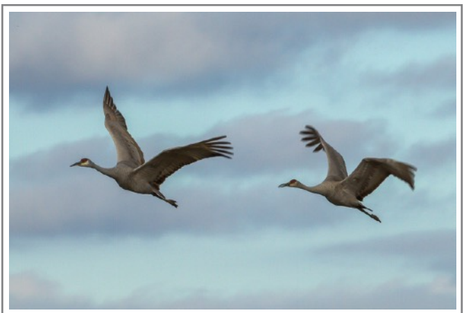
Sandhill cranes at Hiwassee Wildlife Refuge in Birchfield, TN, copyright Dale Potter.