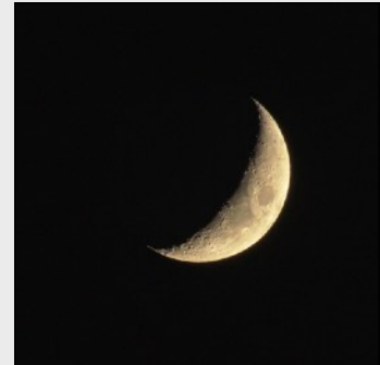
Moon shot.

photographing the moon until I took this shot. With my lens zoomed out to 600 mm and a shutter speed of 1/320 second, the craters on the moon were impressive.