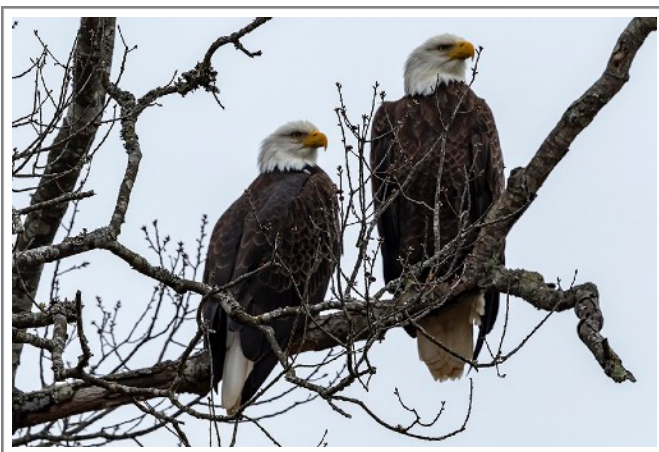
Bald eagles at Fort Donelson National Battlefield in Dover, TN