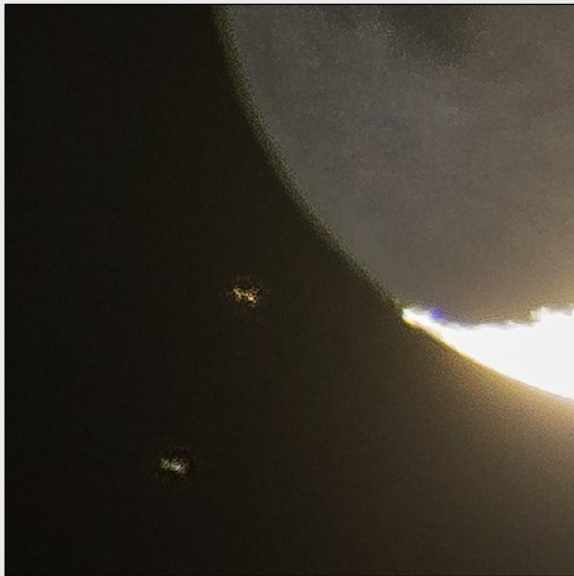
Crescent moon exposed for the shadows.

On the evening of November 19, I got several interesting shots of the crescent moon. First, we all know about the benefits of side lighting in nature photography – shadows and a more three-dimensional appearance. I never considered side lighting in