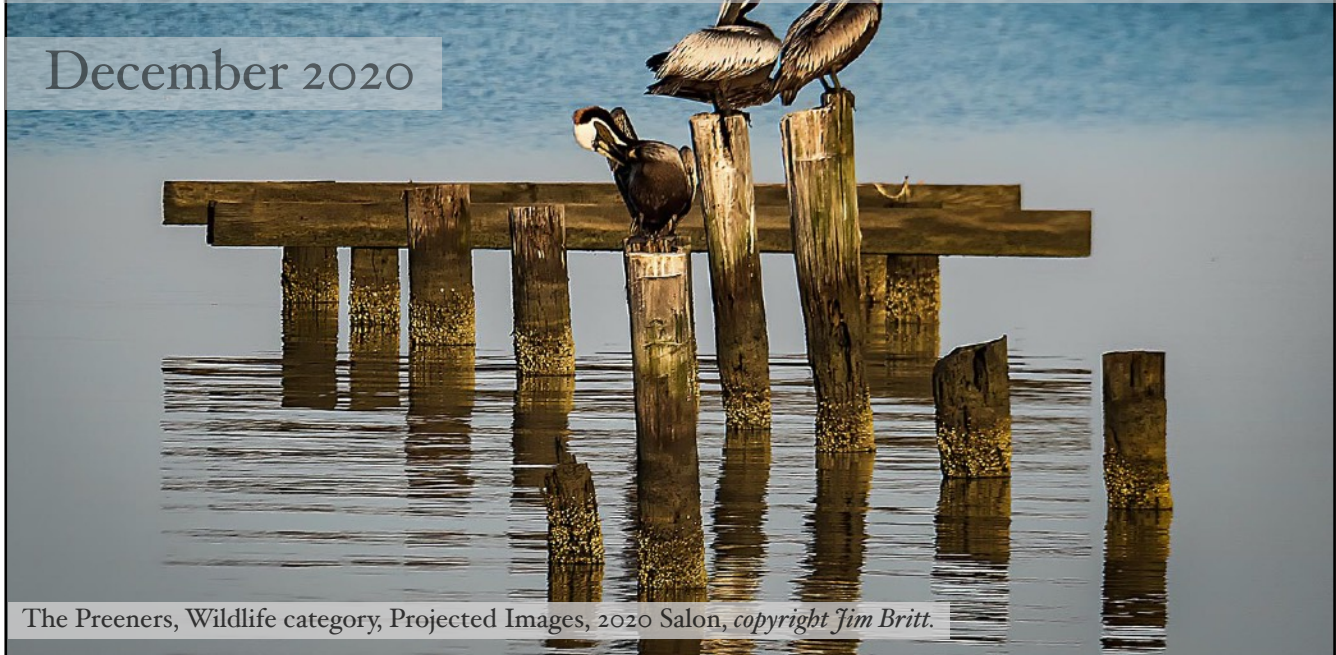
The Preeners, Wildlife category, Projected Images, 2020 Salon, copyright Jim Britt.