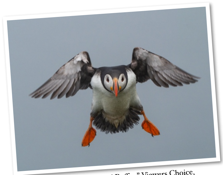
“Incoming Shetland Puffin,” Viewers Choice, 2019 Salon, copyright Ed Stickle