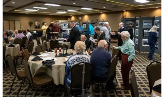
Photos taken at the 2019 Salon dinner, shown on pp. 3 & 4, were taken by Ron McConathy.