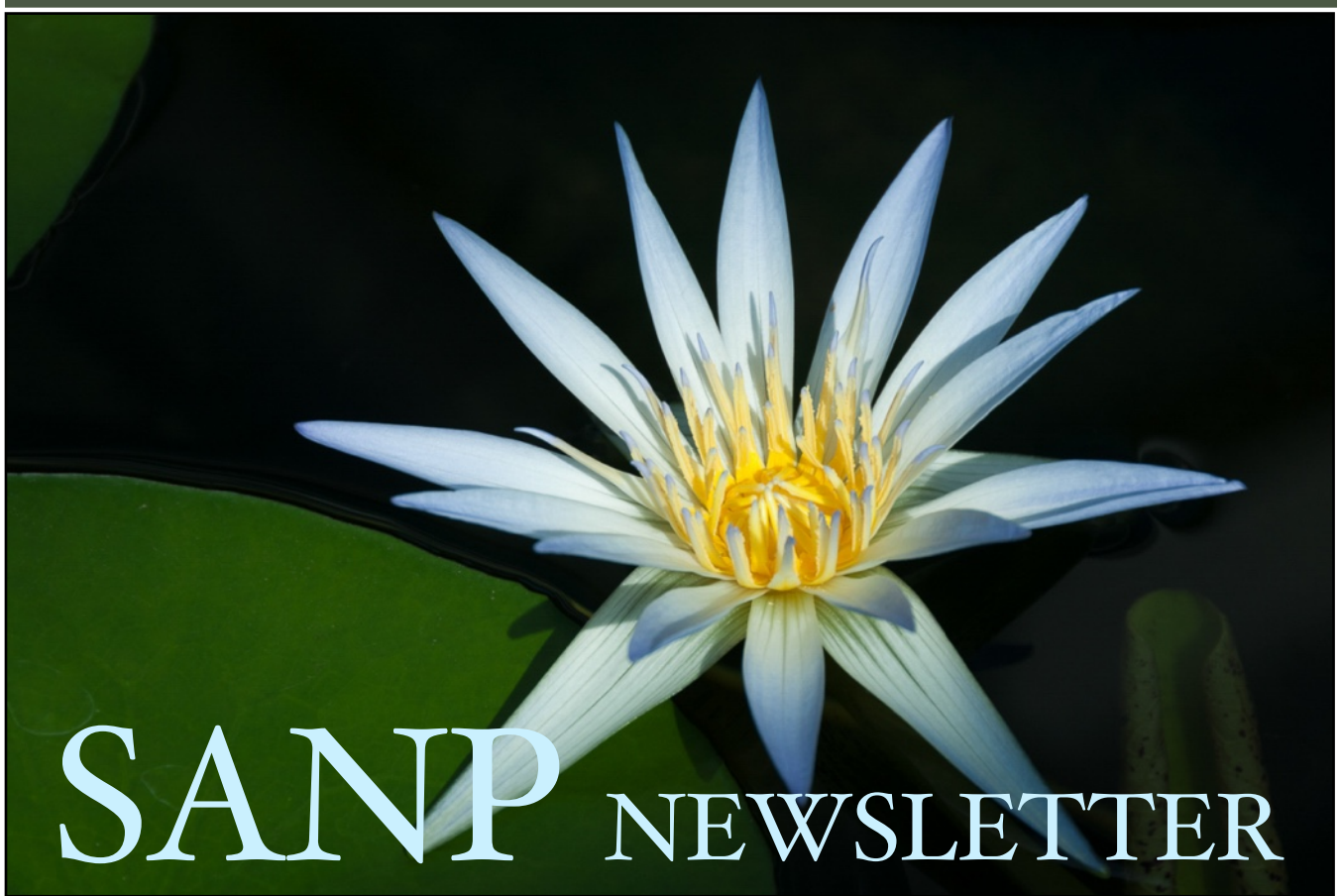
Floating Star. 2017 Salon, First Place, Plants.