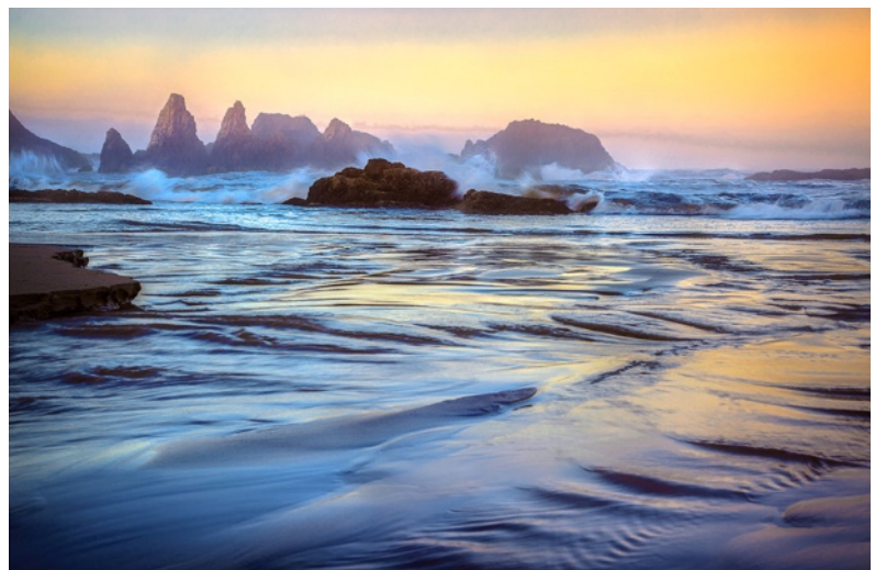
Neptune's Kingdom, Honorable Mention, Scenic Category, 2017 Salon