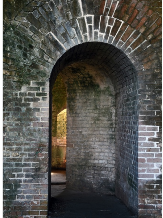
Light at the End of the Tunnel, Travel and Place Category, 2017 Salon, copyright Clay Thurston.